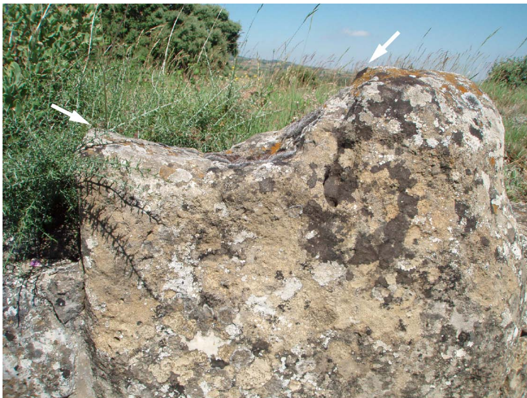
Fig. (6). Dolmen of Layaza. Retouched top of a chamber slab, with unknown age and genesis. Slab width, 1.5 m.

In the La Chabola de la Hechicera dolmen (Fig. 2c), the strong angularity of the Miocene sandstone blocks has been interpreted as reflecting an origin by quarrying [19]. In the neighbouring dolmen of Alto de la Huesera, tumulus blocks with the same lithology are highly rounded (Fig. 5b), inducing to suppose that they have been collected from the surface. Among the fifty-two dolmens visited, two-thirds of the tumulus blocks were collected from the surface and one-third was obtained mechanically by manual fracturation. It is assumed that for a given lithology, the blocks will be collected on the surface or by fracturing according to the principle of minimum effort.