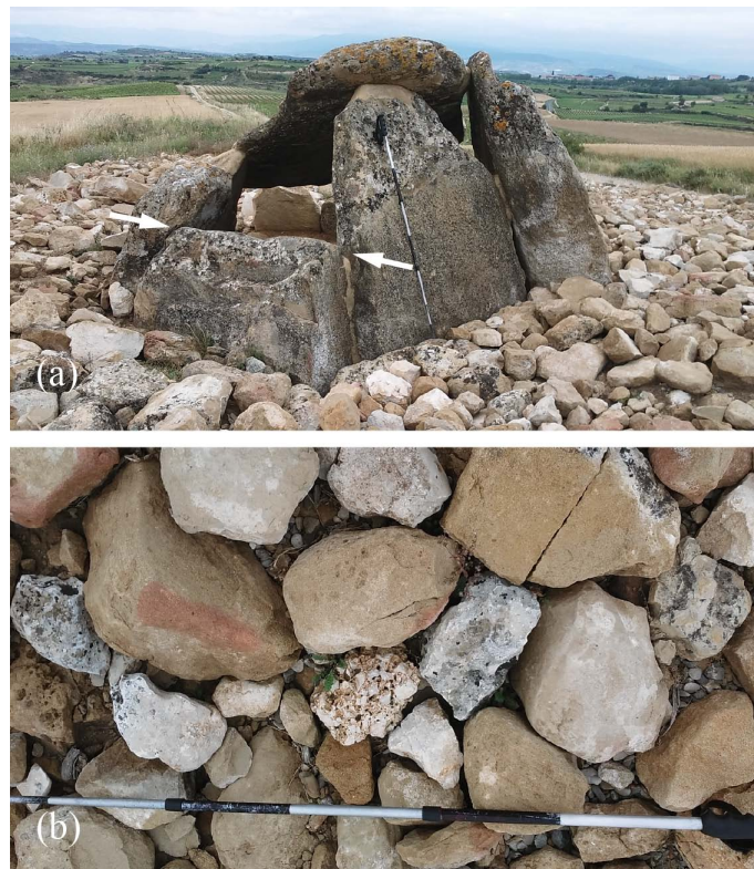
Fig. (5). Dolmen of Alto de la Huesera. (a) Fracture plane in a slab. (b) Blocks of the tumulus. The white blocks are Upper Cretaceous limestone from colluvium of Sierra Cantabria, located 3 km away. The ochre blocks are local Miocene sandstone.

thereby explaining their presence. Therefore, in these tumuli, the selected rocks are consistent with the principle of minimal effort.