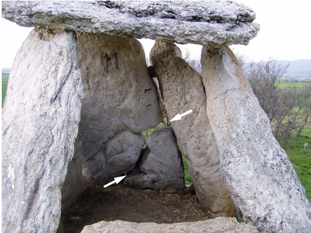
Fig. (3). Dolmen of Sorginetxe. Note the structural fracture along joints. Rounded fractured edges indicate antiquity.

In the Sorginetxe dolmen, the chamber is built of Paleocene limestone. The nearest outcrop of this rock is 3 km away, so this is the minimum distance to be covered to transport the slabs. In the Eguilaz dolmen, all of the slabs are Paleocene limestone, with the only exception of Albian sandstone. Ten limestone slabs, weighing 1000-11000 kg, were transported at least 3 km, and the sandstone block of 4500 kg was transported for more than 5 km. This observation was made by Barandiaran [20] based on the lithology and was corroborated petrographically by Vegas et al. [21]. It is unknown why a slab of Albian sandstone was transported at least 5 km if there were Paleocene limestones available at a short distance of 3 km.