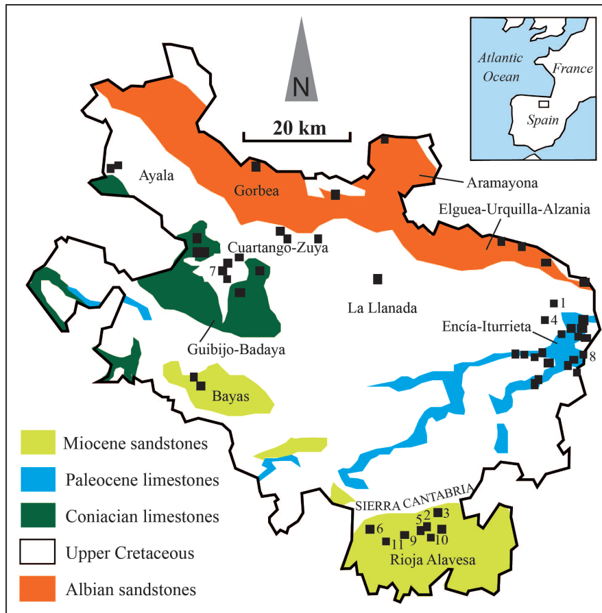
Fig. (1). Geographic and geological locations in Alava. Distribution of lithotectos, megalithic stations and dolmens cited in the text. 1: Los Llanos; 2: La Chabola de la Hechicera; 3: Sorginetxe; 4: Eguilaz; 5: Alto de la Huesera; 6: Layaza; 7: San Sebastian N; 8: Itaida N; 9: El Sotillo; 10: San Martin; and 11: El Montecillo.

The rock types used in the Alavesian historical monuments have been determined in the previous works [7 - 10] and they mainly consist in Palaeocene and Upper Cretaceous limestones and, Miocene and Albian sandstones. In this study, the rocks used in Neolithic dolmens are identified for the first time, with special attention to the lithology, size, and morphology of the materials, and the implications of these characteristics.