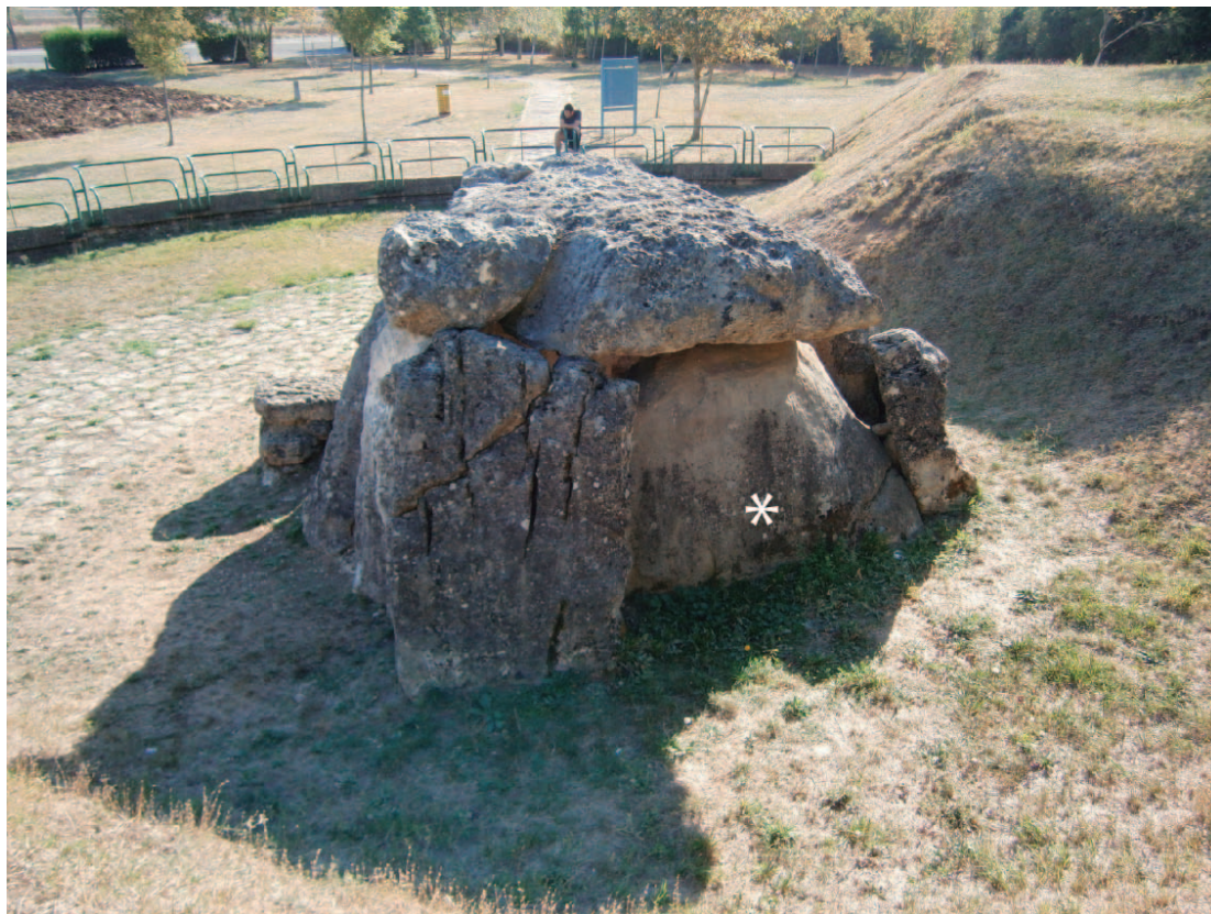
Fig. (4). Dolmen of Eguilaz. All slabs are Paleocene limestone, except for one of Albian sandstone, indicated by the star.

The fractures on the tops of the slabs in the walls of some chambers and corridors are more-or-less conchoidal, with sharp edges. At La Chabola de la Hechicera (Fig. 2b), these surfaces are explained as having been carved to level the covers or capstones of the corridor [22]. In the Layaza dolmen, the tops of almost all the chamber slabs appear to have been retouched (Fig. 6). In both cases, it is possible that the rocks were originally carved on their top edges, but have also been broken during more recent agricultural activities. In either case, the fractured surfaces are angular, indicating that they are not very old.