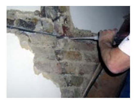
Fig. (12). Crack widening by removing the mortar, loose stones and gallets [3].