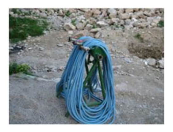
Fig. (18). Equipment for the control of the pressure [3].

inserted in the wall but there is no overflow from a higher level hole then there is a problem which has to be addressed. Ways to do that include the drilling of holes at closer distance or the use of grout with less viscosity. When the process is complete the tubes are removed and the holes are covered with appropriate finish