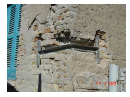
Fig. (13). Reinforcing of the corner by galvanized metal element [3].

When restoring a corner of a stone masonry wall then the following procedure is recommended (Fig. 13):