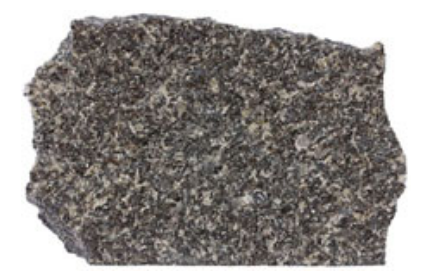
Fig. (5). Diabase [4].

Other types of stones that are used in a much smaller scale include: the Flysch, Gabbro and dunite (Plutonic Rocks), etc. Also in use is the recrystallized limestone from the Mammonia formation found in the Kyrenia range and in Paphos. A famous formation, related with the tradition and the medieval history of Cyprus, which is known as "Petra tou Romiou", is an example of this type of rock.