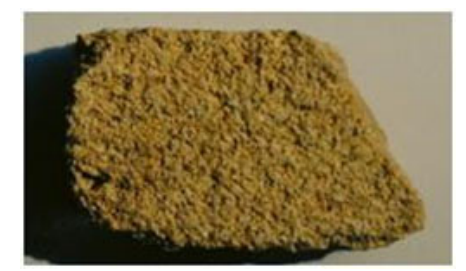
Fig. (2). Calcareous sandstone of Athalassa formation [3].

The stone is quarried from the hills around Nicosia [1] and a number of famous structures are characteristic constructions using this particular stone. It is a holocrystalline porous rock relatively coarse-grained with fragments of calcium carbonate cemented with secondary calcite [2]. Its crushing and flexural strengths are much lower than that of the calcareous sandstone of the Pachna formation and its color is yellow-ochre (Fig. 2).