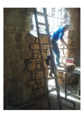
Fig. (9). Reconstruction using tie-stones [3].