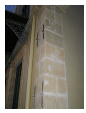
Fig. (14). Typical steel connectors for stone masonry [3].

Steel connectors (tie-rods) can be used to strengthen stone build structures against partial or total collapse and prevent lateral instability of the walls caused by the action of the horizontal structural members. The use of steel connectors is of great importance especially for masonry structures located in seismic zones (Fig. 14).