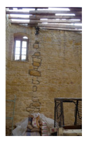
Fig. (11). Crack restoration with tie-stones [3].