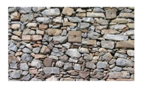
Fig. (6). Dry-stone wall constructed with igneous rocks [3].

In addition, the pattern in which the stones are placed on the wall leads to another classification scheme: