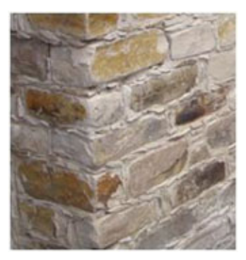
Fig. (3). Chert rock - Wall construction [3].

weathering [4]. It is quarried extensively for the production of crushed gravel and sand for the building industry. It is grey in color and is used extensively as a building stone in the Troodos villages.