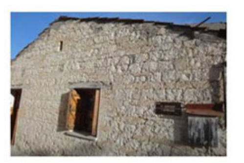
Fig. (8). Isodomic masonry construction [3].

Fig. (7). Classification schemes of stone masonry construction [3].