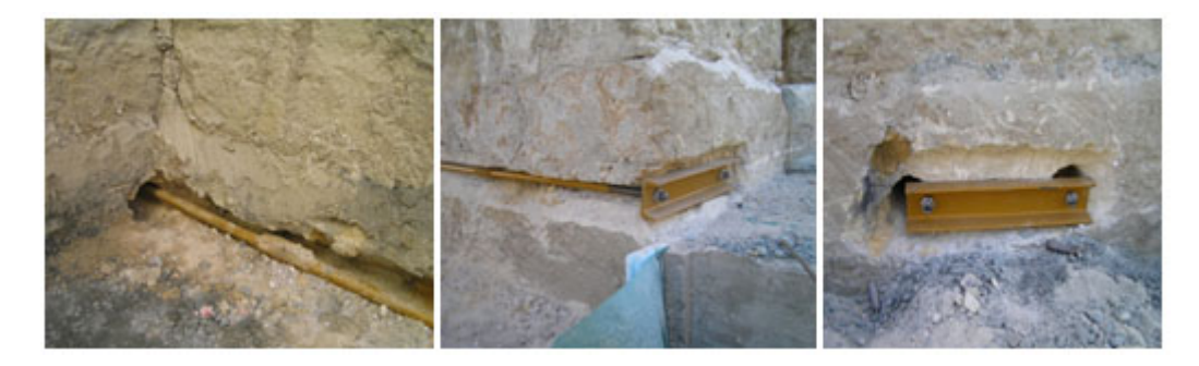
Fig. (16). Tendons installed to masonry wall [3].