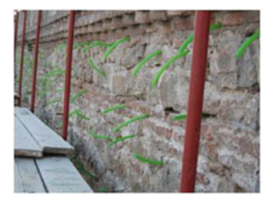
Fig. (17). Installation of a rubber tubes in the wall for the installment of the grout [3].

• The initial pressure is kept constant and 30 MPa until the grout is absorbed by the wall (Fig. 18). Then it is increased to 40 MPa and held steady for 5-10 minutes so that the mixture is stabilized and excess water is drained. However high pressure can create problems to low strength masonry and for this reason the pressure to be used should be calibrated. The injection of the grout starts from the lower part of the wall and continues upward in a systematic way. The lower holes are filled first until there is an overflow of grout from holes at the higher level. Then the lower tubes are sealed. The next holes to fill are those that are overflowed by the grout injection at a lower level and the process is continued until all holes are filled (Fig. 19). In the case that grout is