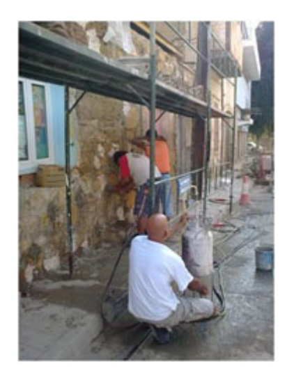
Fig. (19). An overflow of grout from holes at a higher level [3].

Fig. (18). Equipment for the control of the pressure [3].