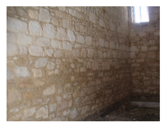
Fig. (10). Stone wall construction (elevation) [3].

Fig. (9). Reconstruction using tie-stones [3].