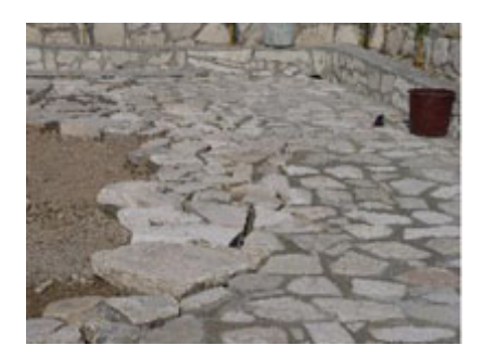
Fig. (4). Construction of pavement from calcareous chalks [3].

Fig. (3). Chert rock - Wall construction [3].